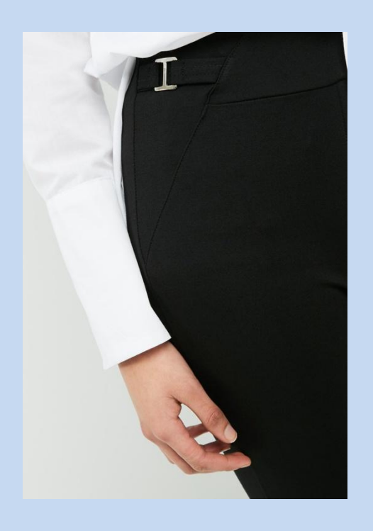
Buckle detail tregging