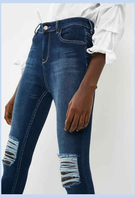
Biker rip & repair Man