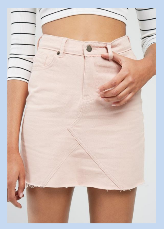
Raw Hem Skirt